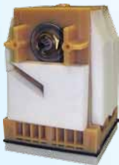
Aquabot: A4510A Aquabot Turbo: A4510T