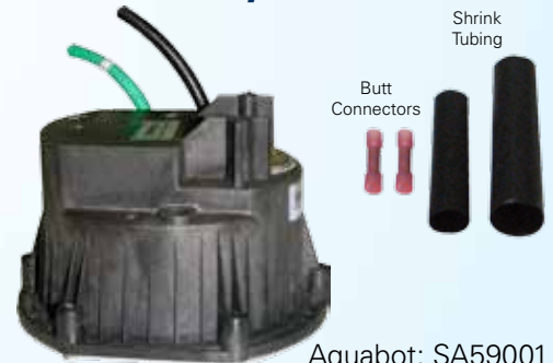
Aquabot: SA59001 Aquabot Turbo: SA59010