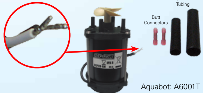
Aquabot: A6001T Aquabot Turbo: SA69031