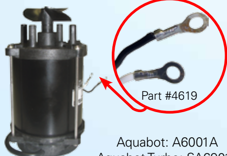
Aquabot: A6001A Aquabot Turbo: SA69012